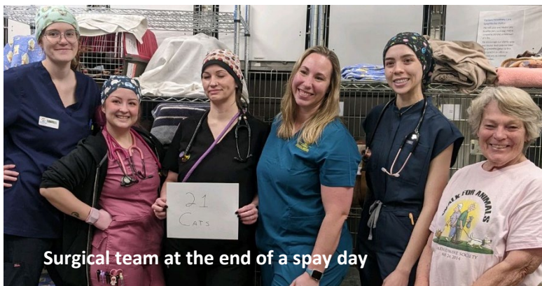
Surgical team at the end of a spay day