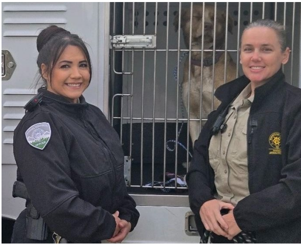
WCRAS staff transporting dogs for spay/neuter for Reno Sparks Indian Colony Spay Day